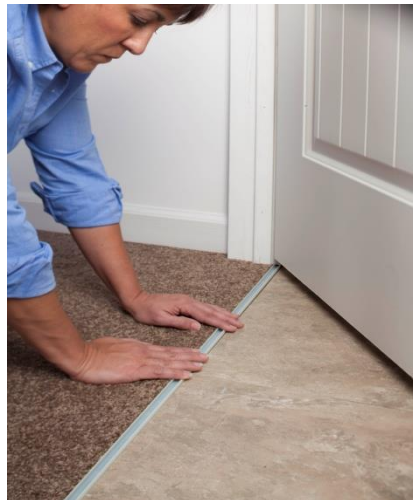
Adhere to floor