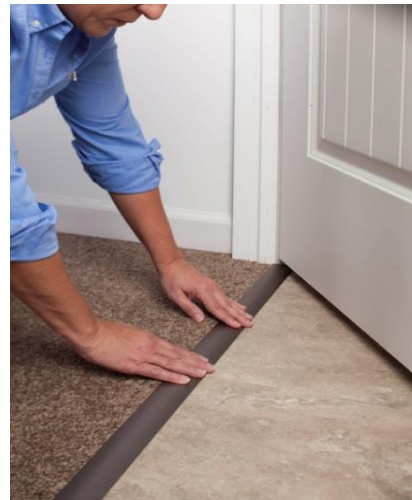
Snap into place