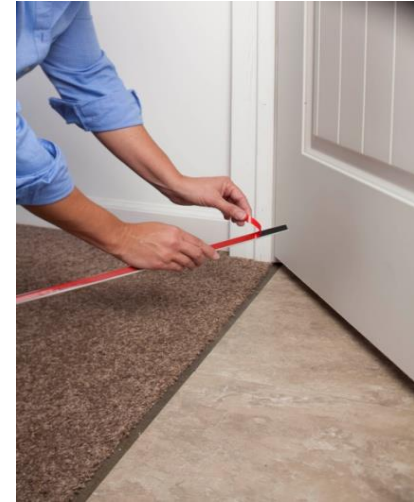
Peel off tape